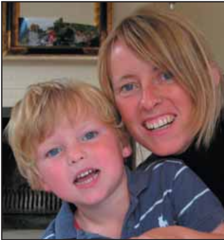
With my son in July 2008