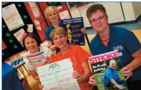
Pulse check clinics were held across the UK, from shopping centres, libraries and offices to GP surgeries!

importance of the campaign and announced that the 'Know Your Pulse' campaign was not just an event for a week or a month; it was a campaign which would only pause when pulse checks