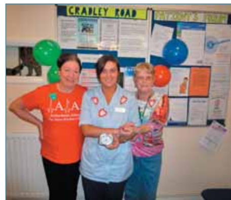
Patients and surgery staff teamed up to run pulse check clinics.

Order your pulse check cards now to pass on to your local GP centre. Be 'Pulse Aware' and help make this year's flu vaccinations an even greater health care event.