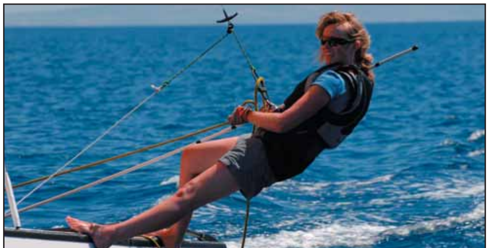
May 2008 back to full strength

I guess what I learnt was that you shouldn't just accept what your doctor says first time, just keep asking. If you are not happy with the answer, go for a second opinion. I also treated my AF like it was a project (I have two files full of all my hospital records at home!). I did go private but only because a nine month wait for an operation was like a life sentence to me. With a lively two year old to look after and a constant feeling of exhaustion, the time I had so looked forward to with my young child was passing by and I think I would